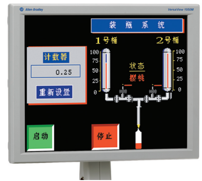
Vesa mount monitor – NEMA 1 Rated Features steel reinforced chassis for industrial environments. (Stand not included.)

All light industrial monitors ship with a USB and RS232 serial touchscreen cables, a VGA video cable and an AC power adapter.