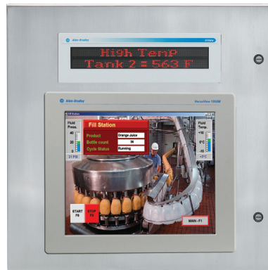
Panel mount monitor – NEMA 4 Rated Features cutouts consistent with existing VersaView monitors.